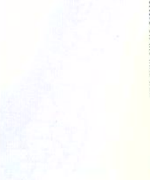
Porters on the Inka trail